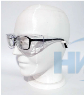
Over the glass design