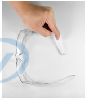
Elastic temple tips