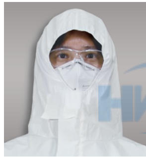
Personal Protective Equipment